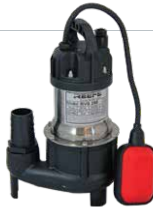
REEFE Submersible Pump (RVS200)