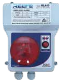
REEFE Liquid Level Alarm (RLA10)