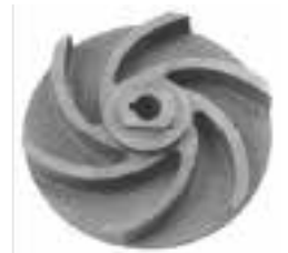
Cast Iron Impeller Components